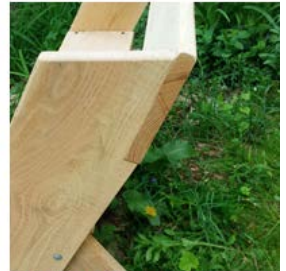
Set back into front legs for comfort