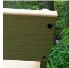
Screw back to front legs