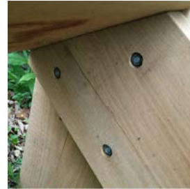
Countersink nuts on inside