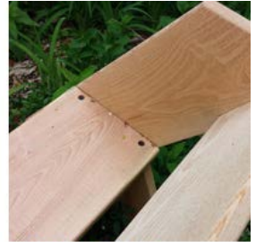
Screw seat to back legs